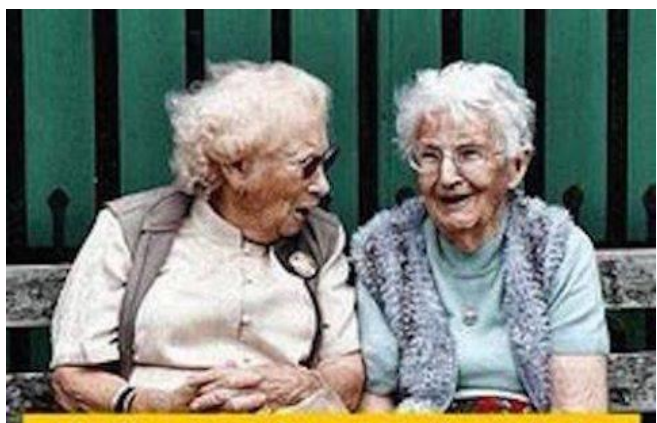
I believe my house is haunted. Every time I look in my mirror a crazy old lady stands in front of me so I can't see my reflection!