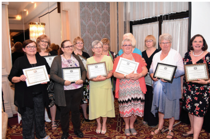
Barbara Bain Membership Awards