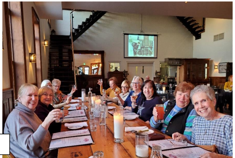
Dining Divas at Spirit of Niagara. A fabulous venue.