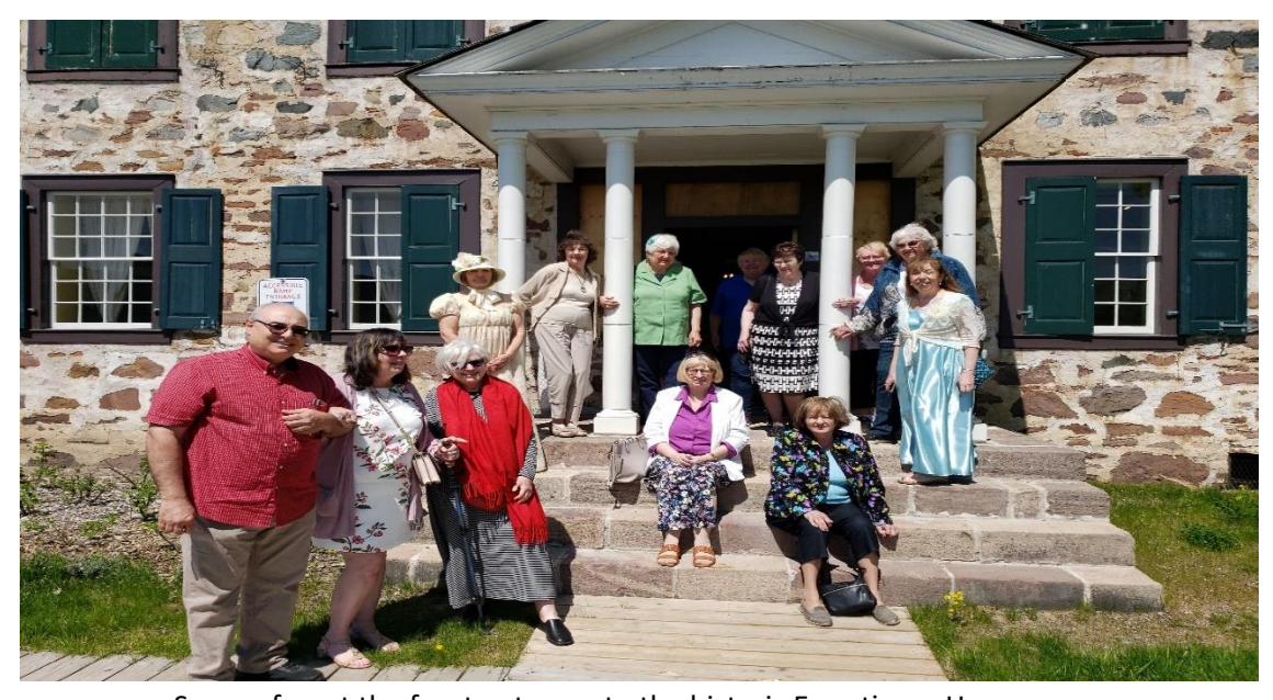
Some of us at the front entrance to the historic Ermatinger House.