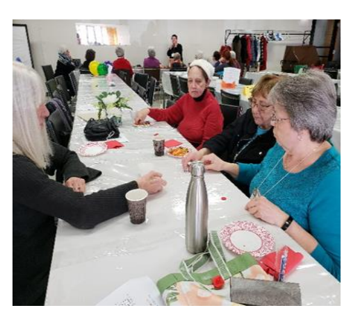
Playing "Left, Right and Centre".