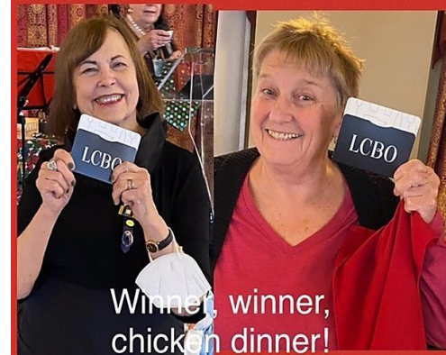
Winner, winner, chicken dinner!