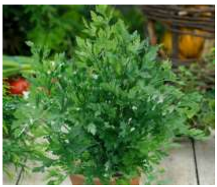
10. Chilli peppers