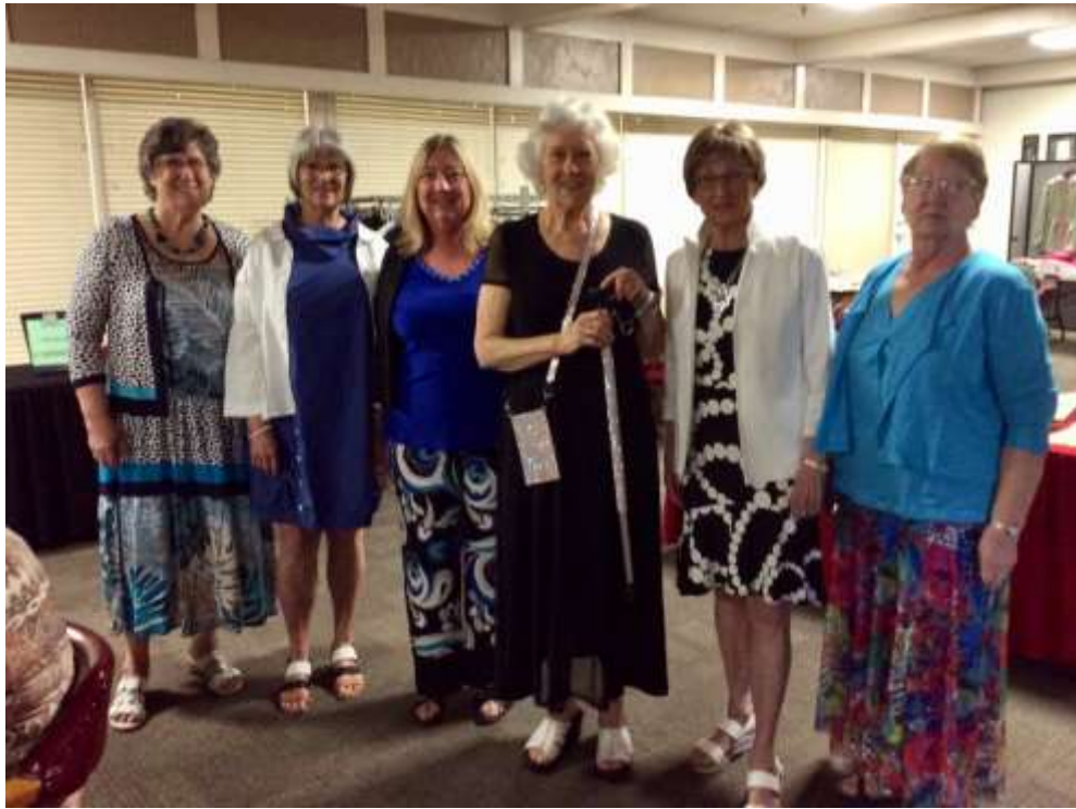
Our Fashion Show Luncheon with Lady Sophisticate and our gorgeous models.