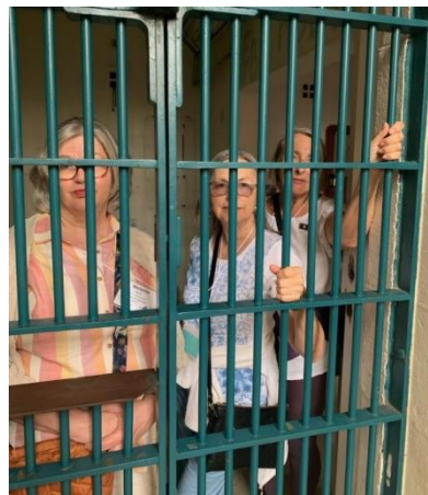
Group Tour to the Kingston Penitentiary