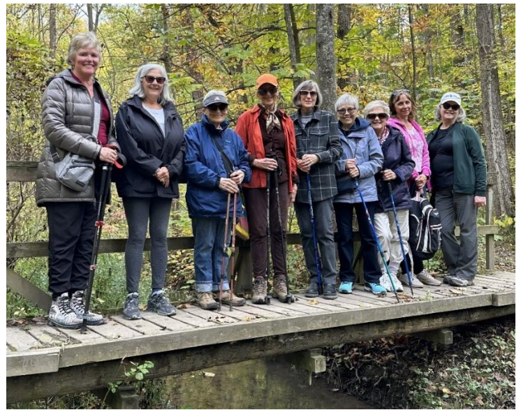
Friday Afternoon Walkers