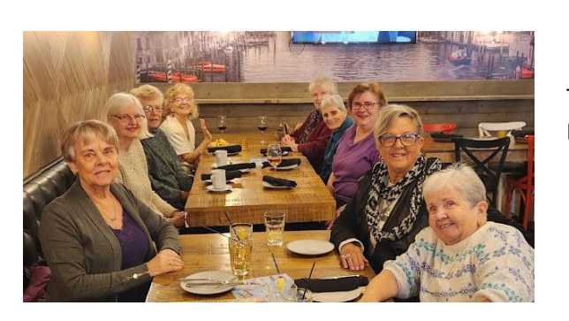
The Lunch Bunch at the Industria Pizzeria & Bar, Pen Centre, January 2024