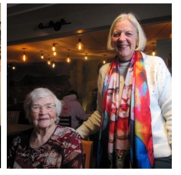
The Travelogue Group met for a Mexican Fiesta at Chili Agave in December 2023