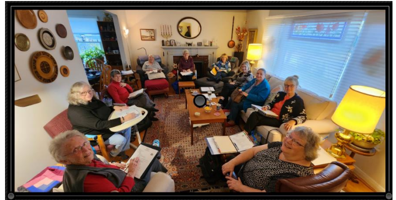
Your Executive at work!