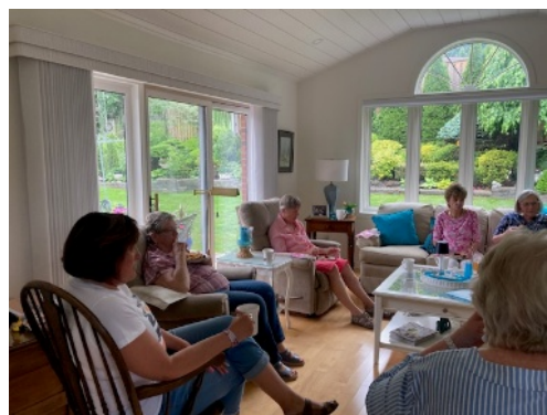
December social sharing time