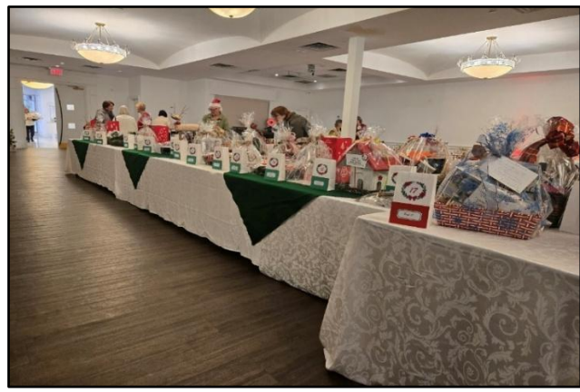
Our raffle was popular with our members