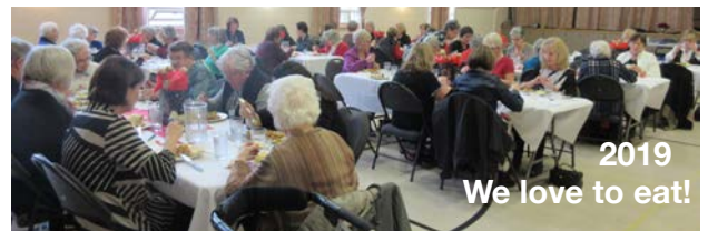
2019 We love to eat!