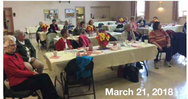
March 21, 2018