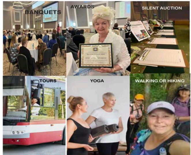
RWTO/OERO Jubilee Convention 2026 Chalk To Change June 2nd, 3rd, 4th, 2026

Members and non-members will be aware of what is entailed in our organization, including that we are a Not-for-Profit organization.