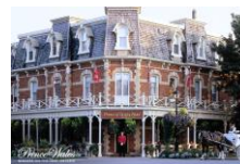
Prince of Wales Niagara