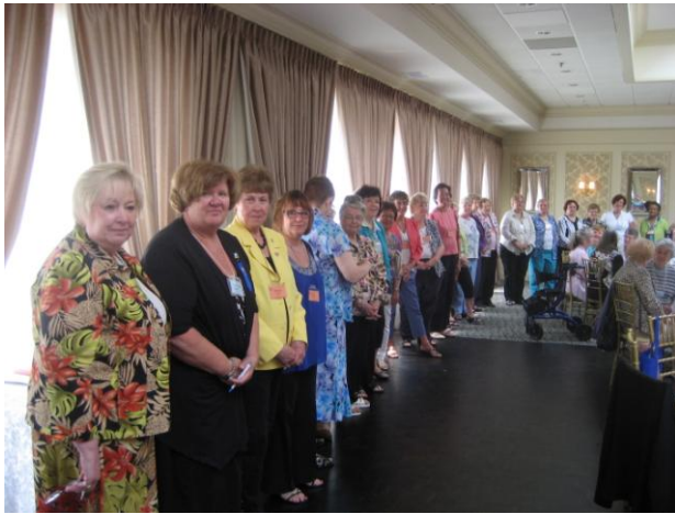
All the ladies who volunteer to make good things happen at RWTO Scarborough.