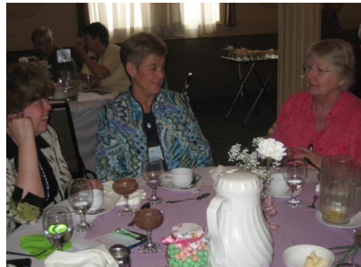
Our lovely lady members...