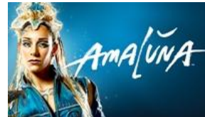
Cirque de Soleil