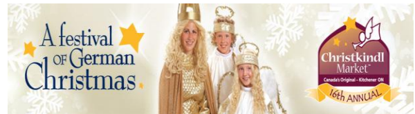
Christmas in Waterloo