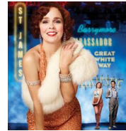
Festival Theatre Stratford