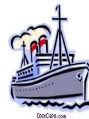
Cruising the British